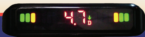
Camera and LCD display option