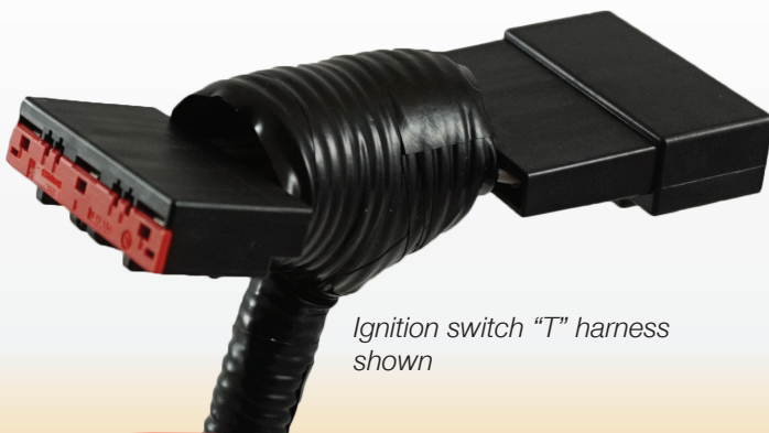
Ignition switch "T" harness shown

Product features may vary by make, model or year. See instructions for complete details.